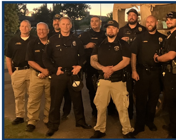
Earlier this month, members of the Oakley Police Department visited neighborhoods all over the City for the annual National Night Out— part of OPD's efforts to serve and protect our community.