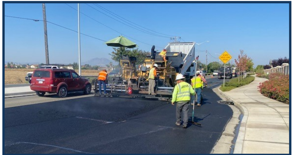
Street repairs and resurfacing projects will be taking place in the near future.

Once a budget for the new fiscal year repair and resurfacing project is established, staff reviews the above-mentioned factors to determine which streets will receive treatments that will benefit the community and best utilize the available budget and then makes recommendations to the City Council for approval.