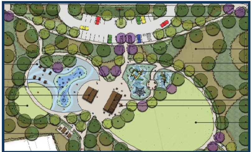
A preferred concept sketch of the upcoming Enrico Cinquini Park.

Coming soon! A brand new park- Enrico Cinquini Park—will be located at the northwest corner of the Rose Avenue/Carpenter Road intersection, adjacent to the new residential neighborhoods. The property that will encompass the new park is approximately four and half acres and is currently a vacant piece of land. The features of the park will include a new natural turf field, site grading, landscaping and irrigation, a half basketball court, a parking lot, a splashpad water feature, a playground and a covered picnic area.