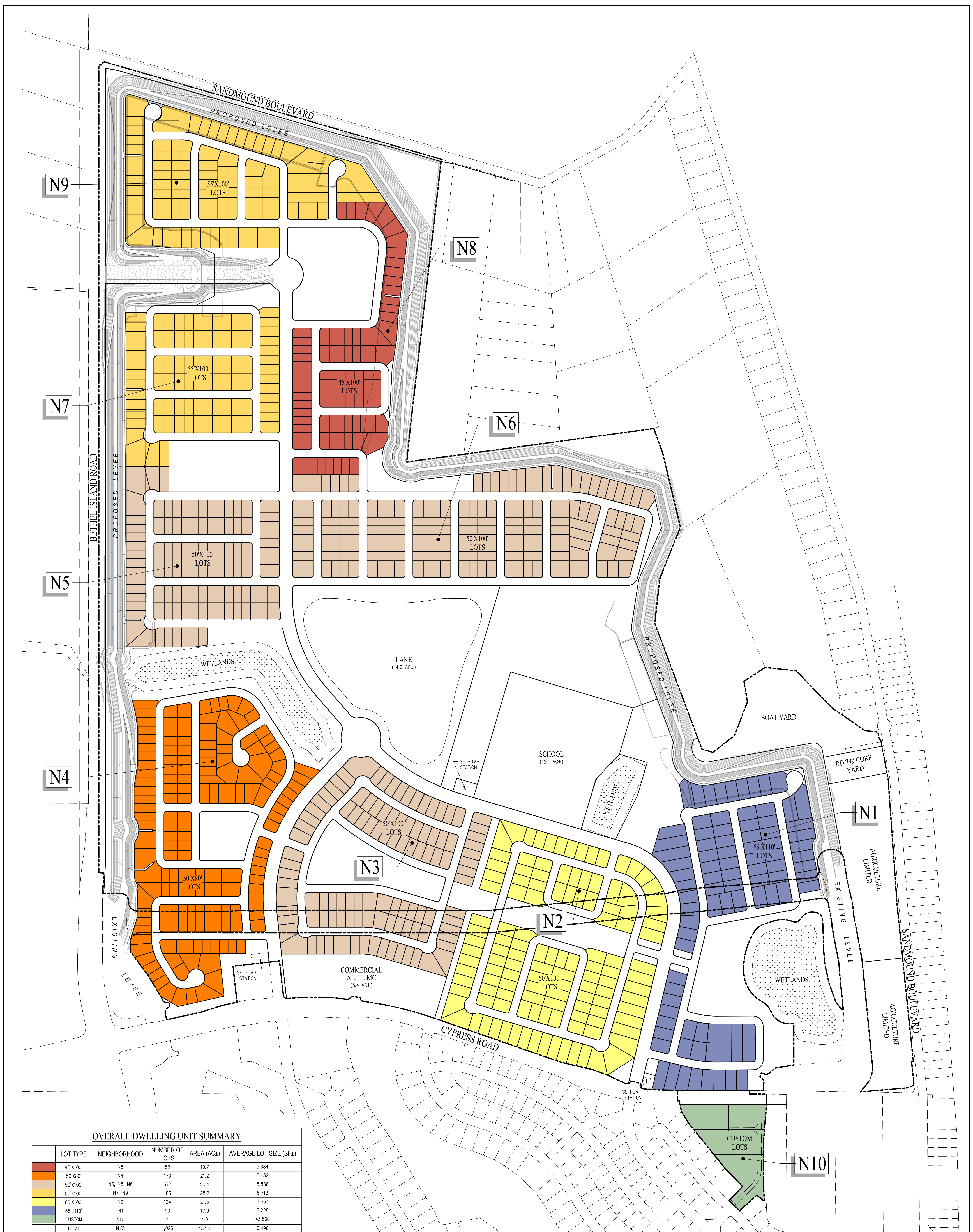
OVERALL DWELLING UNIT SUMMARY