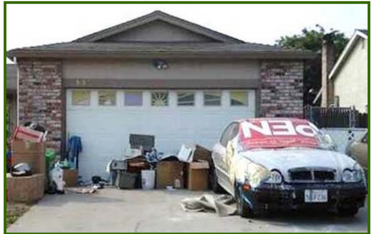
Can you spot some of the multiple code enforcement violations in this picture?