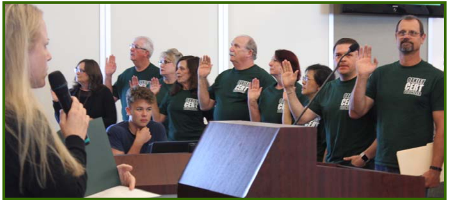
Our CERT volunteers were sworn in at a recent City Council meeting.

CERT-trained residents also enjoy many opportunities to volunteer in their communities during non-emergencies like special events.