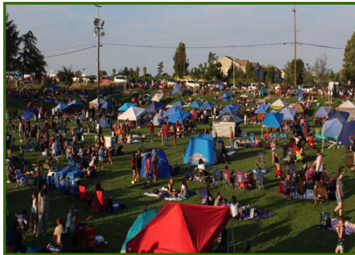
Thousands of Oakley residents gathered together on July 6th to celebrate Oakley's 20th Anniversary of becoming a city.