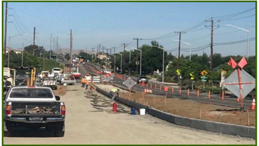
Laurel Road west of Rose Avenue is pictured above and Laurel east of Rose is pictured below as construction continues on pace to finish by the end of this summer.

The contractors working on Laurel east of