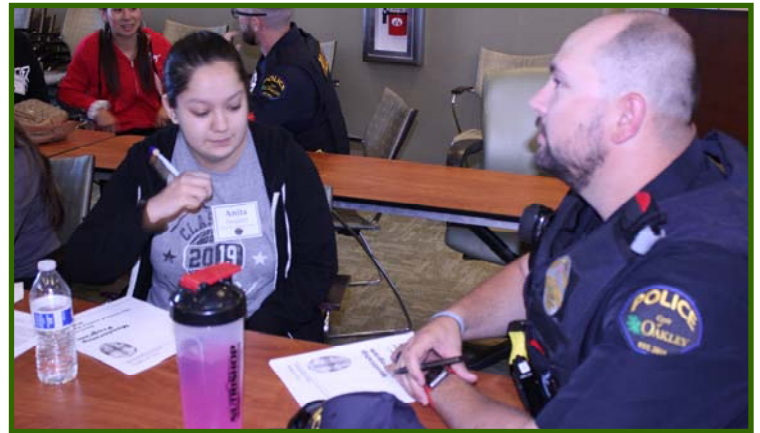
Oakley police officers and teens came together for a special youth mentoring program this spring.

You, Me, We Oakley is dedicated to host-