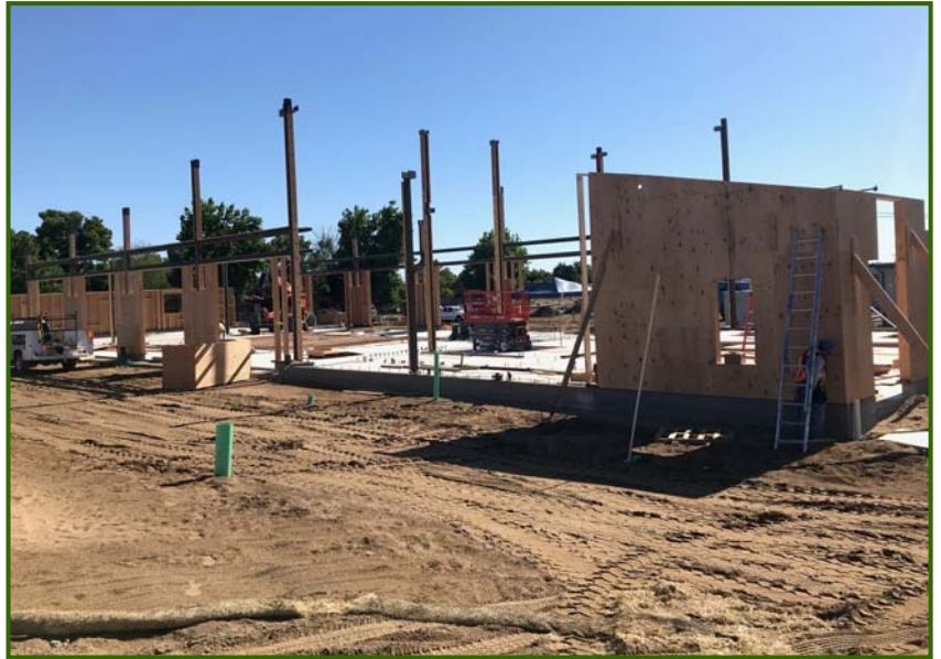
The walls are starting to go up in the new Recreation Center . Construction is set to be completed by the spring of next year.

An additional component of this project is the athletic field which will be constructed on the east side of the new building and will accommodate baseball and soccer activities.