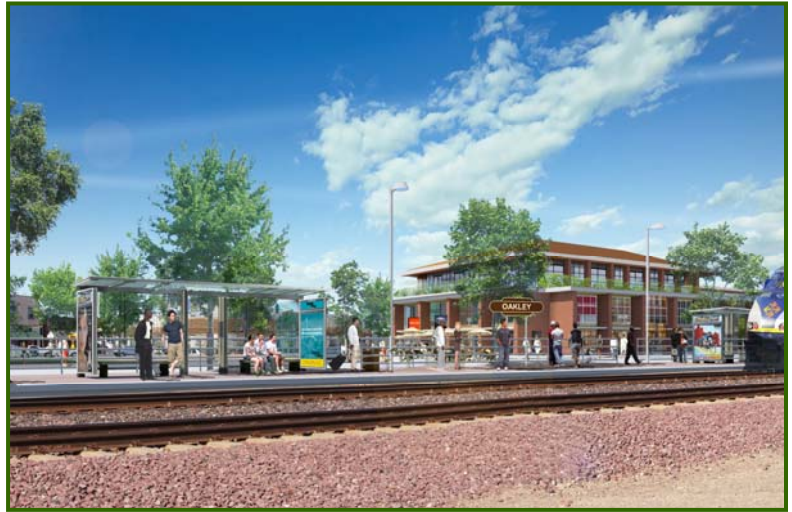
An artist's rendering of what Oakley's Commuter Train Station might look like when it opens.

The viability of a multi-model train platform in the Downtown was analyzed in the "Downtown Oakley Development Study" funded by a grant received from Contra Costa Transit Authority. This