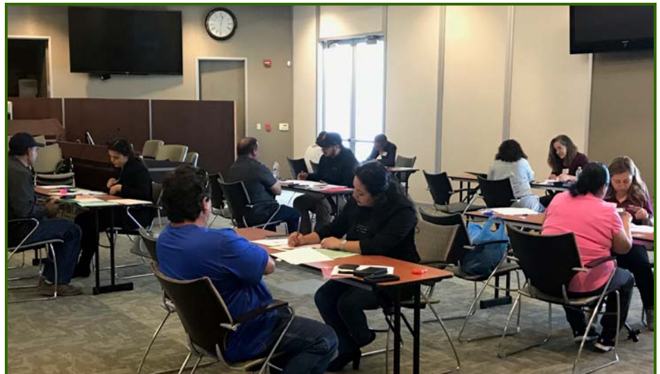
Over a dozen Oakley residents began their journey toward citizenship at a recent YMWO event. The next YMWO Citizenship Drive is scheduled for September 15th.

Recent activities made possible through YMWO include: quarterly citizenship drives, the Heart of Oakley Festival's cultural and entertainment sub-components, dinning dialogues, citizens' leadership academy, translation of City forms/policies, informational workshops such as "Becoming American" or "Dia de los Muertos," implicit bias training and related follow-up trainings that equip City Staff to offer impar-