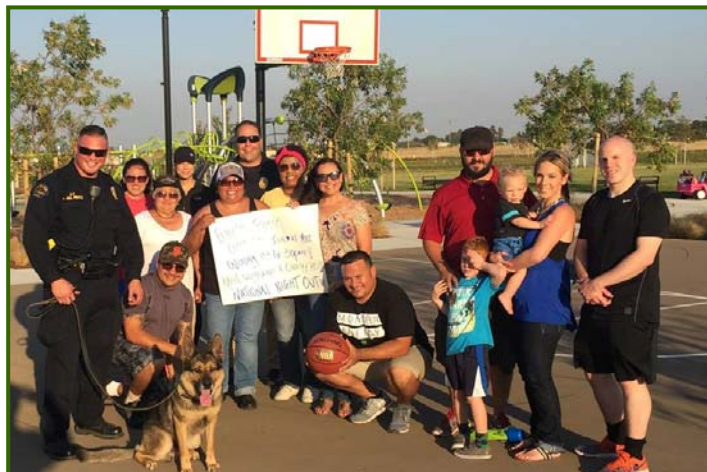
Last year's National Night Out was a big hit. Sign up now to host a celebration in your neighborhood.

National Night Out is a chance for Oakley residents to get to know each other and