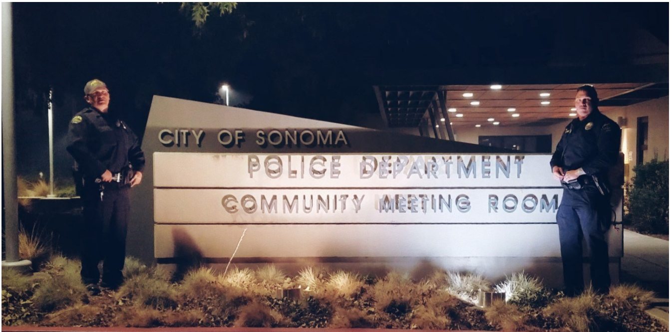
Oakley Police Department helping our friends at the Sonoma County Fires