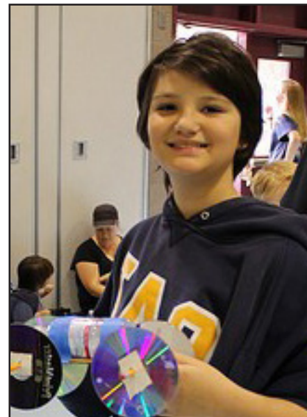
Enjoying projects during Science Week

Trying out the climbing wall at the 2017 Oakley Cityhood Celebration