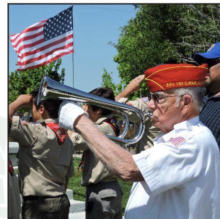
Memorial Day Ceremonies