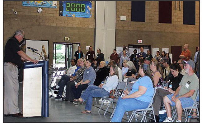
Community-Wide Strategic Planning Meeting in 2016

Additionally, the City Council hosts a Community-Wide Strategic Planning Meeting during which residents will break out into smaller discussion groups facilitated by City staff to brainstorm specific action items within each of the Areas of Focus. Please join us for this meeting which will take place in April.