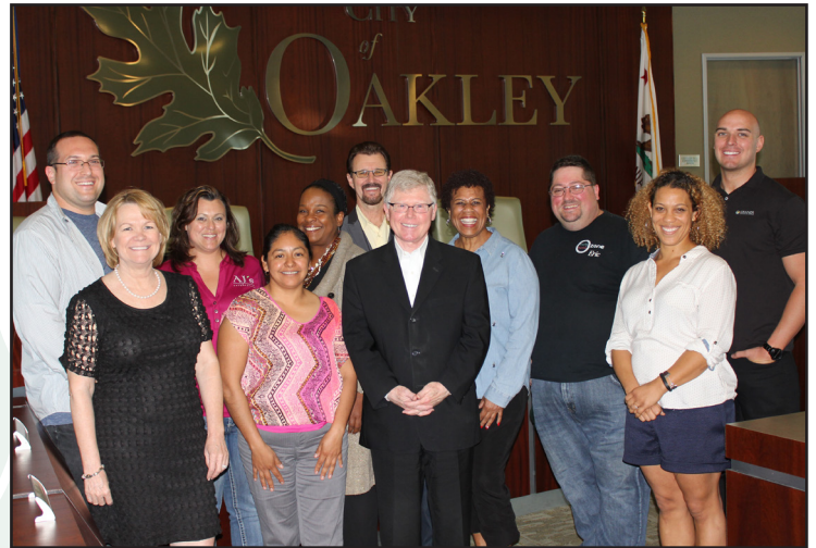
Graduates of the 3 rd Annual Entrepreneur Training Program