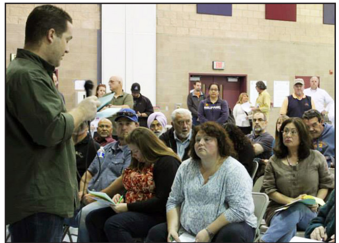
Community-Wide Strategic Planning Meeting in 2014

The purpose of the survey is to measure our residents' satisfaction with our overall performance and satisfaction with specific services, as well as the quality of life. If you are among the 500 to receive our survey, please return it in the stamped envelope provided. If you're not among the 500, don't worry, as the same survey is made available online for the broader community to participate through our website. Continued on page 3