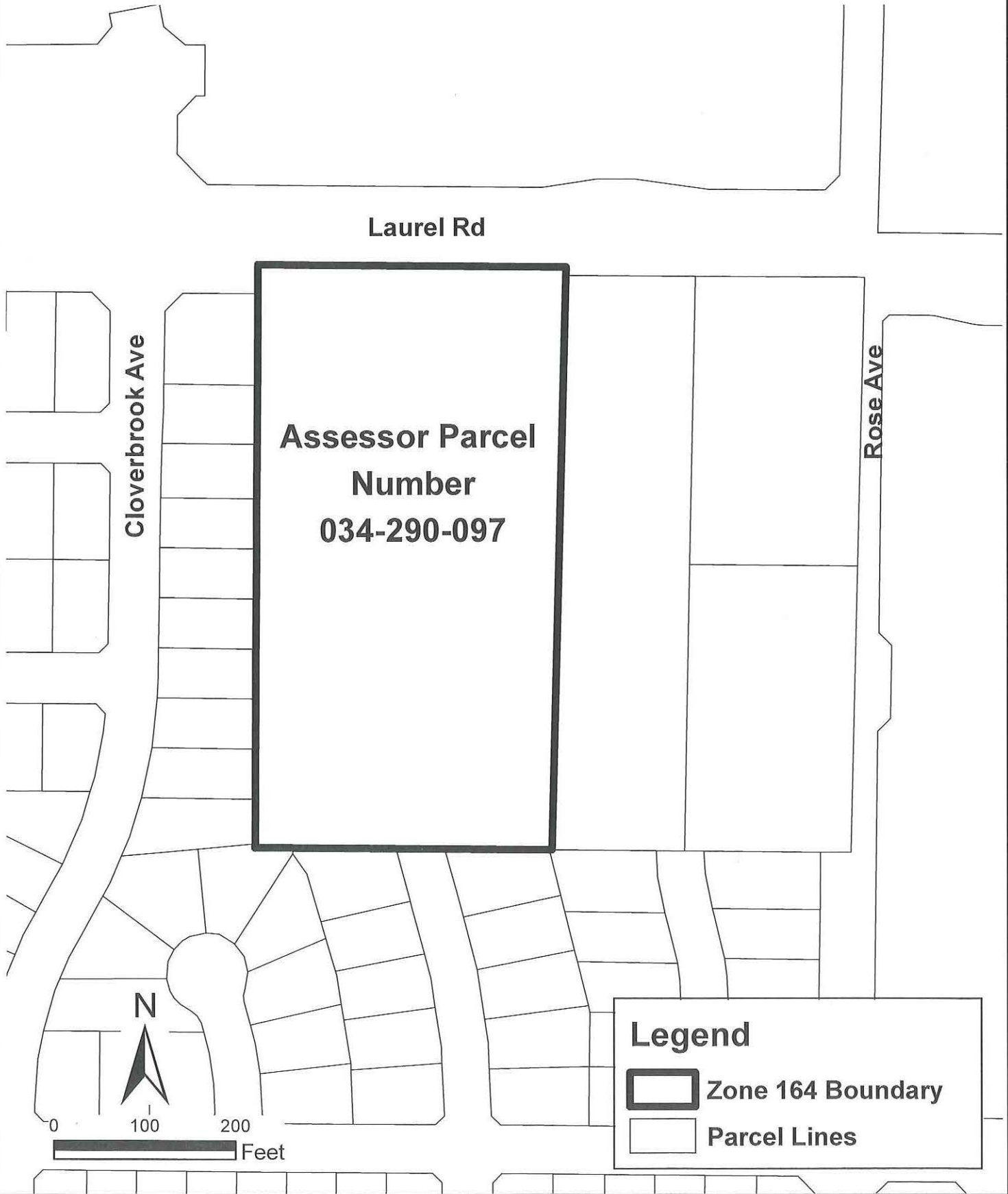
EXHIBIT A - BOUNDARY MAP CITY OF OAKLEY SPECIAL POLICE TAX AREA ZONE 164 CITY OF OAKLEY COUNTY OF CONTRA COSTA, STATE OF CALIFORNIA