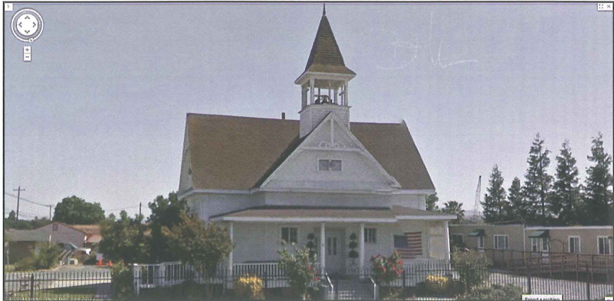
Figure 1. Google Street View of Previous "White" Church

colors used, the original color chart and brush cut outs included with the application will be distributed to the City Council at the time of the hearing.