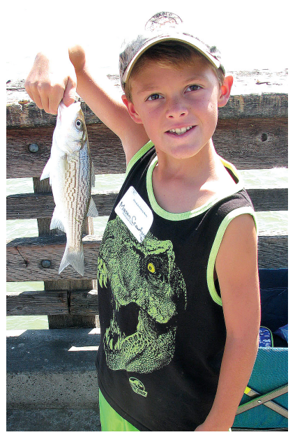
Kids Fishing Derby catch!

Bring your lawn chairs and blankets and enjoy a free showing of the movie Sing at the Civic Center Park! All movies begin approximately 30 minutes after sunset. Snacks and beverages can be purchased at the snack bar. See the Municipal Calendar for more movie dates.