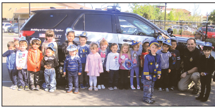
Niños preescolares visitan el departamento de policia

En resumen, con los ahorros logrados hemos crecido el Departamento. En el año fiscal 2015/2016, el Departamento de Policía de Oakley tenia una dotación autorizada de 28 oficiales de policía. Hoy