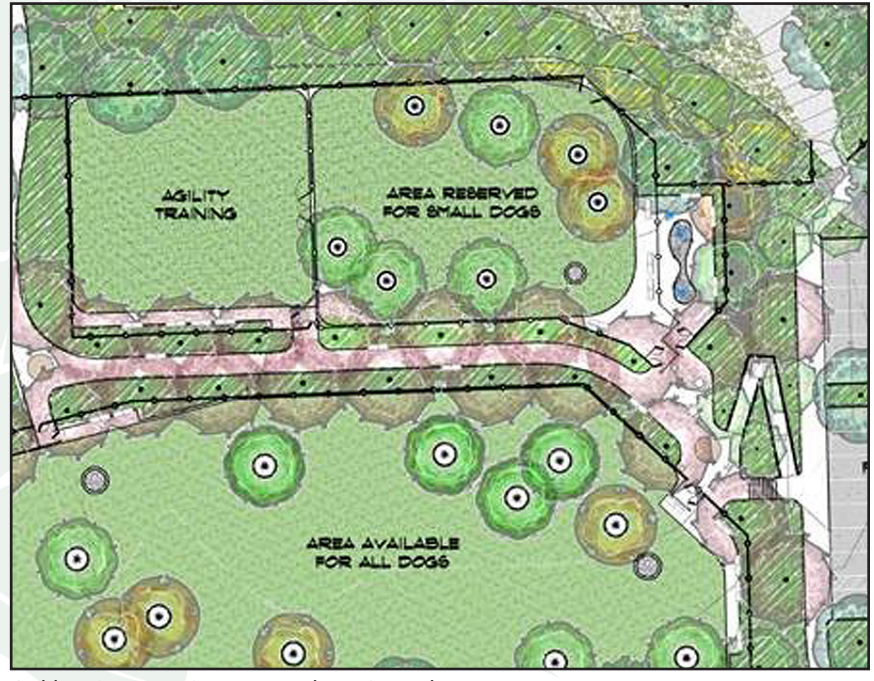
Oakley Community Dog Park Project Plan

The new dog park is approximately two and one half acres and located adjacent to the existing Nunn-Wilson Family Park. The main features of the dog park include a dedicated large dog and seperate small dog play area, a dog water play area, a dog agility training area, a parking lot accessible from Oxford Drive, a restroom, and a shaded group picnic area.