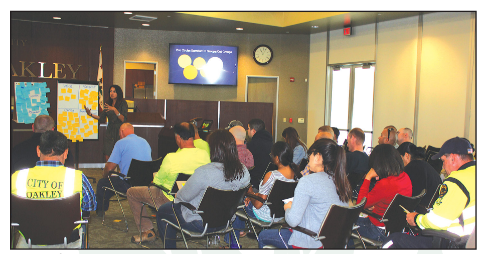
City Staff attending the Implicit Bias Training

This past May, City Staff, including the Police Department, spent three hours learning about subconscious attitudes (often called "implicit biases") and procedural justice.