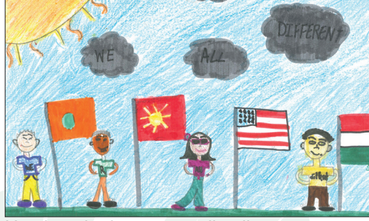
Un ejemplo de arte estudiantil

eventos como los talleres de ciudadanía, Día de los Muertos, Leer Para Crecer etc., inmortalizara este mensaje a través de la escultura de varios