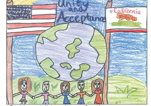
Oakley children's art for the new monument

Program activities aim to create opportunities for our diverse