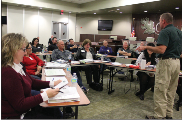
Citizens' Leadership Academy in session

Last month, the Oakley 2014 Citizens' Leadership Academy yielded its first graduating class of 23 residents. The graduates were recognized by the City Council during the January 13th City Council Meeting.