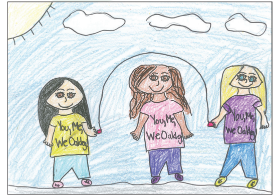
Oakley children's ceramic tile art

that divide." Watch for the unveiling this spring.