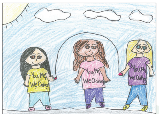
Un ejemplo de arte estudiantil

El programa You, Me, We Oakley!, el cual organiza/patrocina