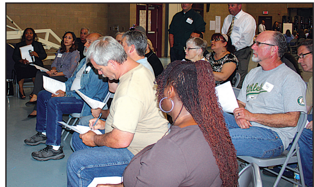
City residents hard at work during the town hall meeting