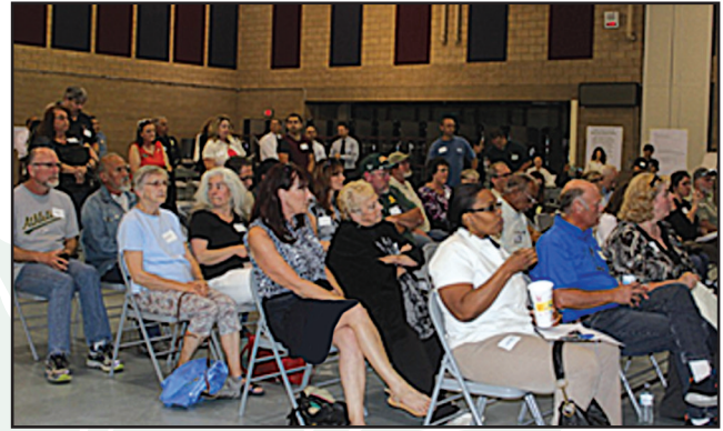
Oakley residents attend special town Hall meeting.

Additionally, the City hosted a Town Hall Meeting during which residents got a chance to participate in smaller breakout sessions where they were tasked with brainstorming action items. Input also came in through the City's new online citizen engagement forum, called Engage in Oakley .