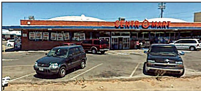
Old Centro Mart 2007