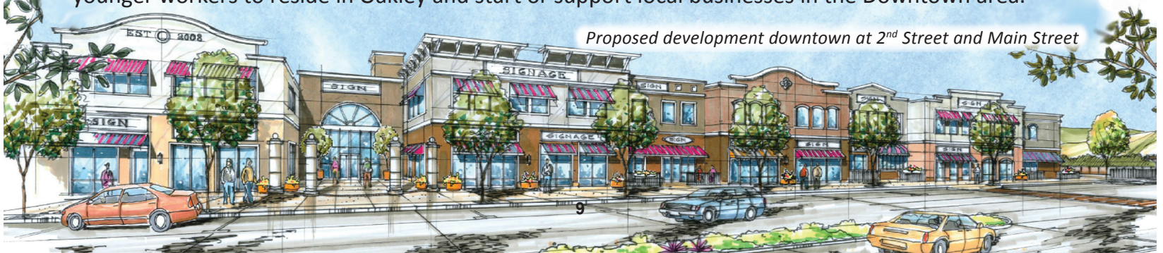
Proposed development downtown at 2 nd Street and Main Street

The convenient access to regional transit, based on national research, would also raise residential home values in the surrounding neighborhoods and promote townhome development, which encourages younger workers to reside in Oakley and start or support local businesses in the Downtown area.