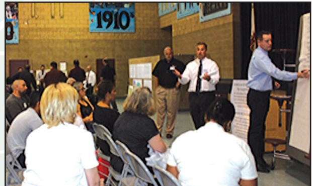
Staff and residents brainstorming ideas during special town hall meeting.