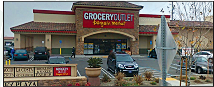
New Grocery Outlet store 2016