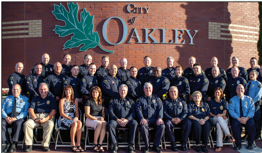
The new City of Oakley Police Department

As a stand-alone agency, we will be responsible for our own records and property functions. In the past, to obtain a copy of a police report or have property returned, we asked you to go to Martinez.