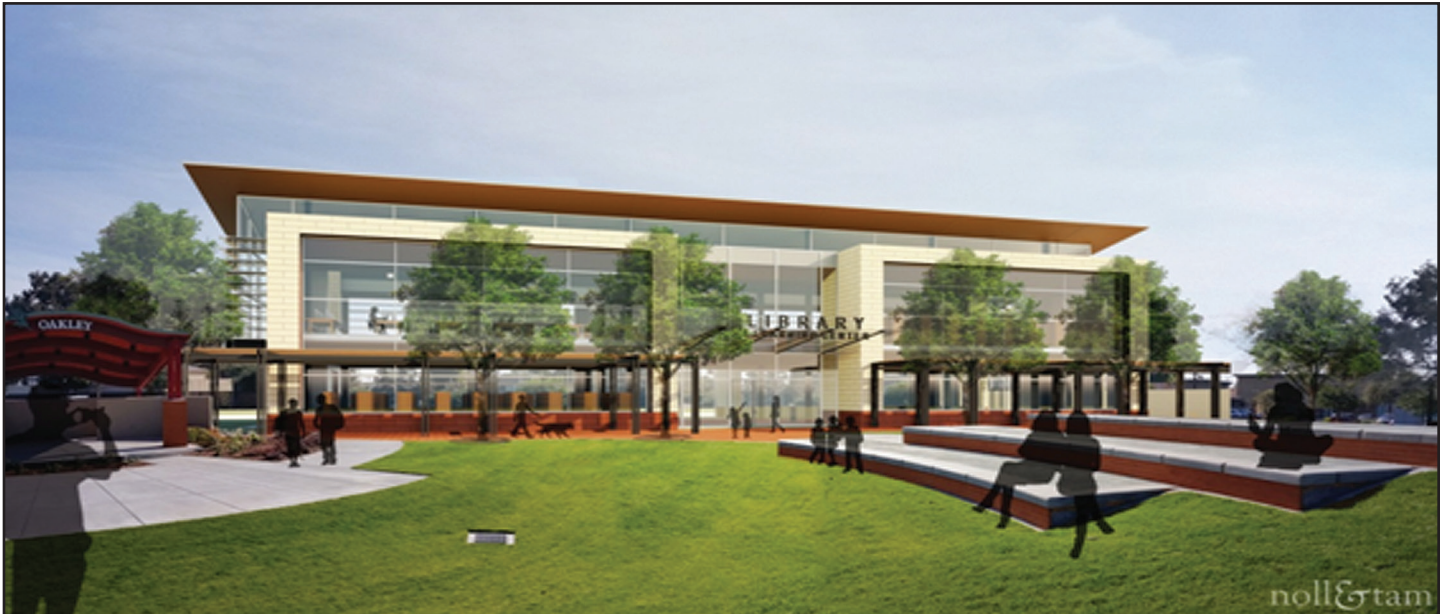
Above is an artist rendering of a possible Oakley Library and Community Learning Center. Learn more on page 4.