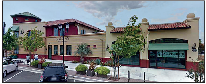
Carpaccio's on redesigned Main Street corner 2016