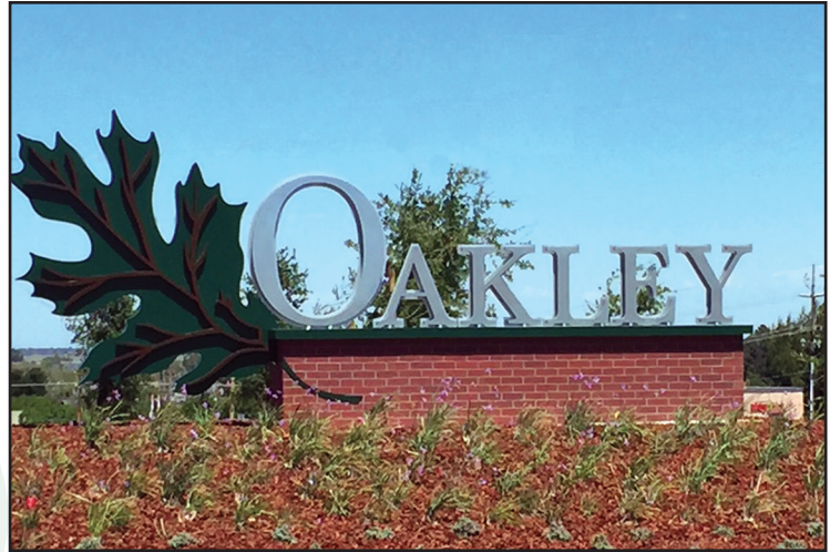
New Oakley City Gateway sign

Similar to the monument signs around the City, the Gateway sign is internally illuminated and will be highly visible in the evening hours after the sun has gone down. The new landscaping and sign significantly enhance the appearance when arriving into Oakley and similarly complements the new roadway and median recently completed on Main Street.