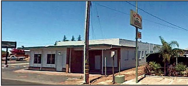
Old dilapidated building across from City Hall 2007