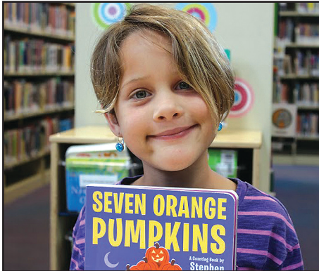
Young book enthusiast

These include Coding for Kids , homework help, computer classes for seniors, inclusive story times, financial literacy workshops, and more.