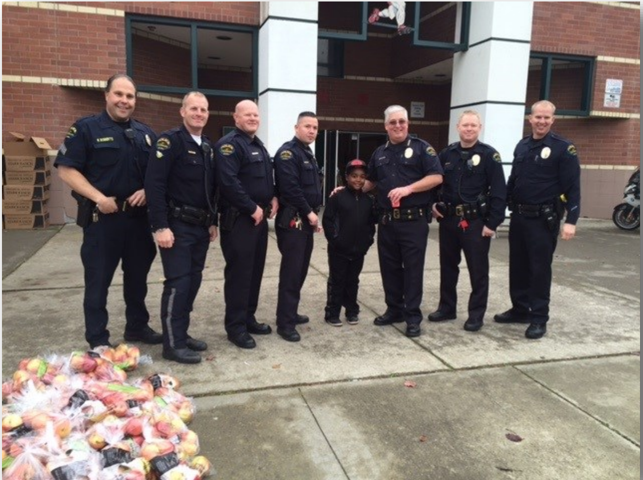
Members of the Oakley Police Department and their families joined with the friends of Oakley to distribute gifts and holiday meal baskets to the Oakley community.