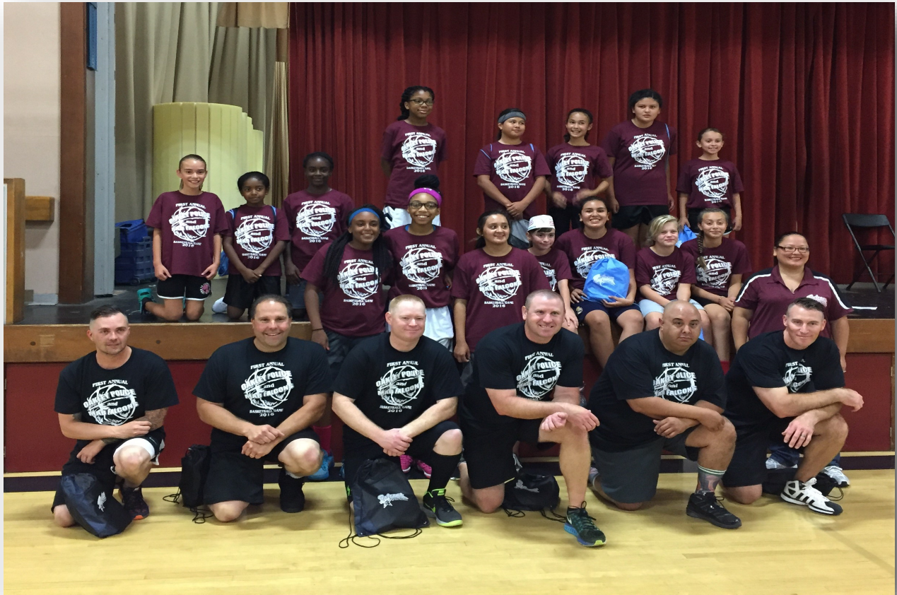
8/26/2016 Oakley Police Department vs. MAB Girls Basketball Team

The Oakley Police Department participates in a number of community events during the year. Pictured is the first competition between member of the Police Department and the MAB Basketball program.